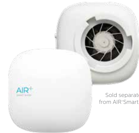
Sold separately from AIR+ Smart Mask

That's why children and the elderly are encouraged to wear the Smart Mask with the AIR+ Micro Ventilator for breathable cool comfort.