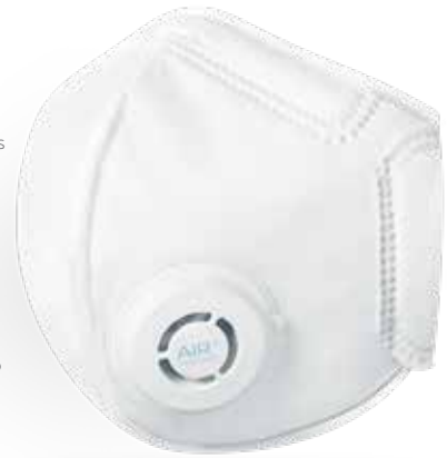
Standalone Smart Mask Essential protection

Total Comfort Superior fit with adjustable straps