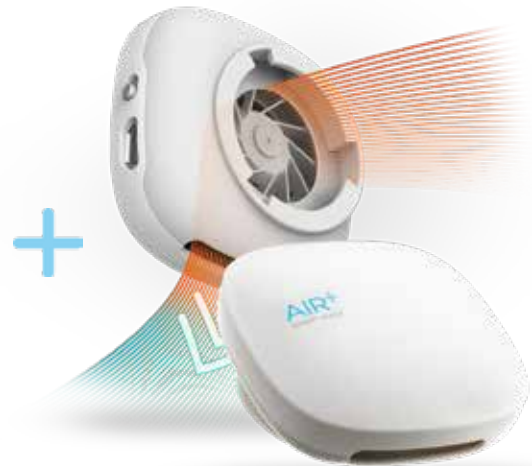
AIR+ Micro Ventilator (Reusable add-on) Enhanced comfort and safety

Keep Cool & Fresh Reduces temperature by 4°C for true comfort